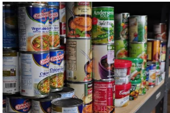
Many Thanks! Gloria Dei Service Committee Members

All non-perishable items are appreciated, for example, canned food, soups, boxed macaroni and cheese, ramen noodles, pasta, rice, peanut butter, jelly, granola bars, and condiments of any kind. Also, be thinking about the upcoming holidays with contributions of stuffing mix, broth or broth mix, canned cranberries, boxed mashed potatoes, gravy mix, canned pumpkin, canned milk, pie crust mix, canned sweet potatoes and marshmallows, and the like.